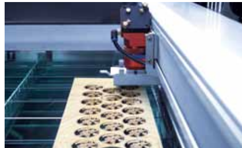
Wood 4 mm

Thin and light materials that tend to lie unevenly on the base can be engraved, cut or marked in combination with the vacuum table (e.g. films, plastic laminates, veneers, paper, etc.). The well-designed adapter system provides for maximal vacuum effect.