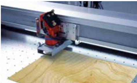
Veneer 0,5 mm